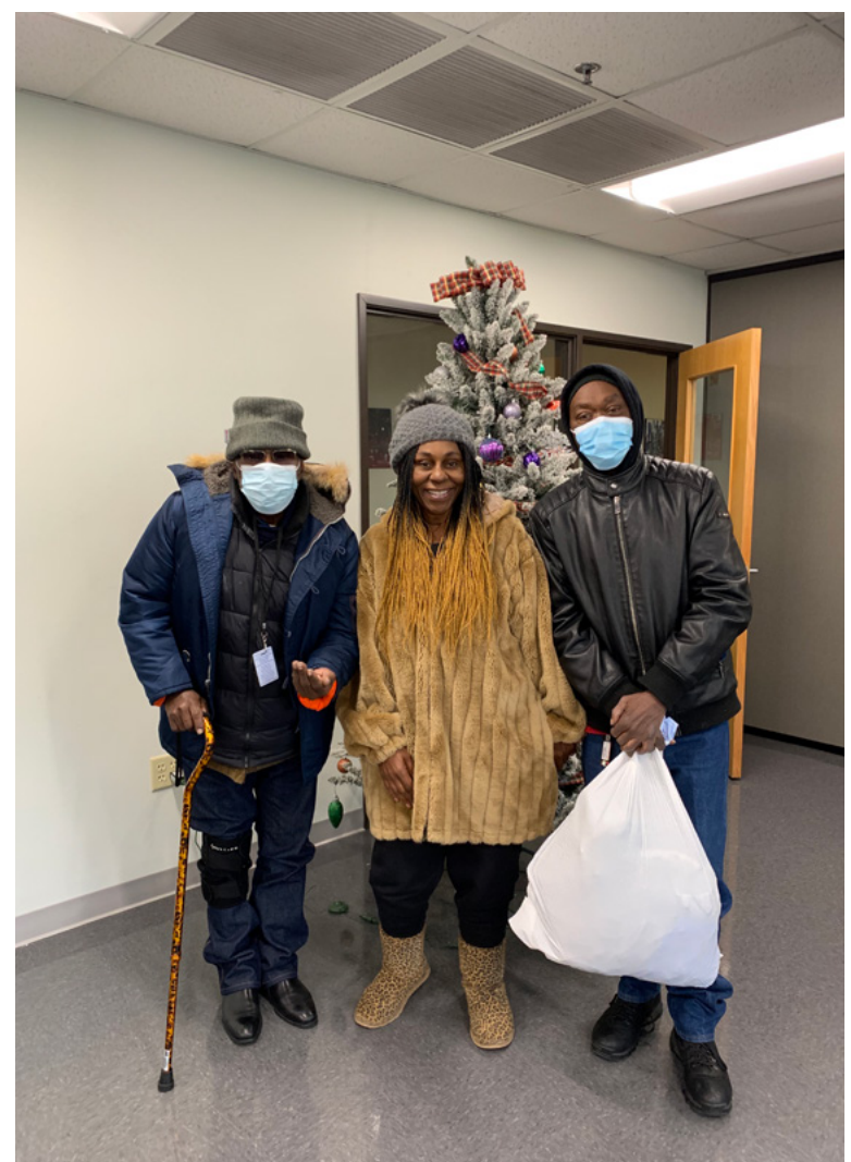
Stewpot clients were able to shop for their own winter coat.