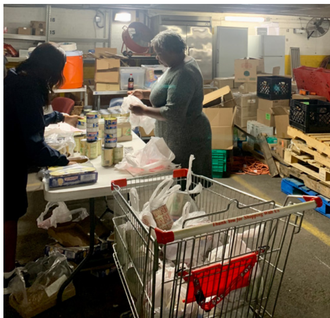
Volunteers prepping orders for The Stewpot's food distribution.

The Dallas Morning News recently reported that the rising housing prices and inflation affect many individuals and non-profits. The families attribute their need to the gift-giving season. For many, it is a choice between buying groceries or purchasing other necessities.